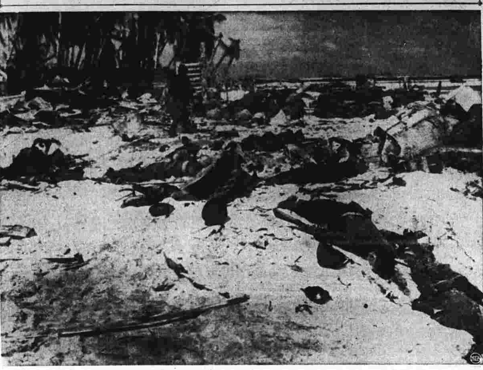
This was a Jap fort on Tarawa