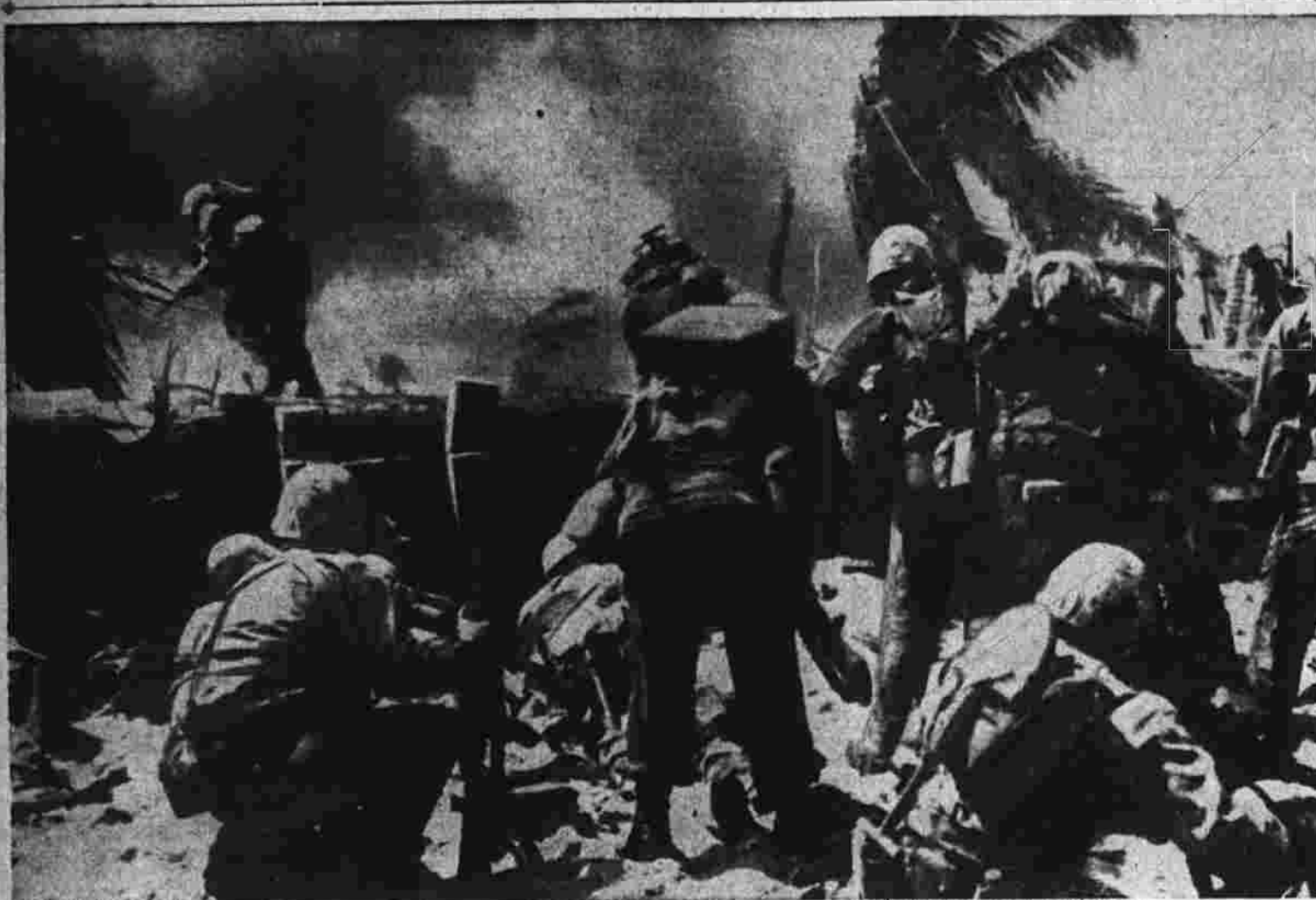
A Marine photographer caught this dramatic moment in the battle for Tarawa, one of the Gilberts, as Marines left the beachhead to storm across barricades and take the airport strip in the face of the Japanese fire.